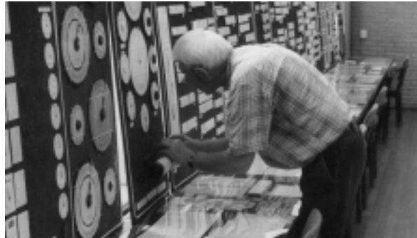
IM 2000 Exposition of a major Dutch Collection

A large exposition will be organised on many aspects of the UTO firm. It will include (half-)finished slide rules and individual parts, manufacturing tools and instruments, scale films, process blocks and many more items from UTO.